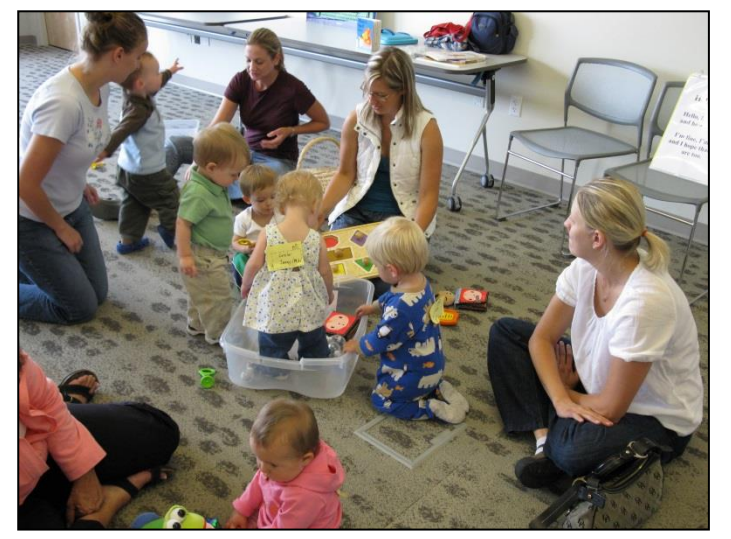
Playing with toys after Peek-a-Boo storytime at CTL.

Following a month-long hiatus in August, District-wide storytimes resumed September 2. CTL staff was excited to see our young friends again! From September through May, CTL staff presents Toddler storytimes twice on Monday mornings and twice on Tuesday mornings. We also present storytime for preschool ages twice on Monday mornings and twice on Tuesday mornings. We offer Peek-aBoo for babies twice on Wednesday mornings, and one, all-ages Saturday storytime on Saturday mornings. During the summer, storytimes specifically for toddlers and