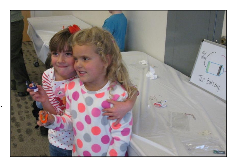
Two girls show off their creations at the Rosie Revere, Engineer program.