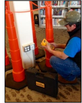
Testing connectivity at circ desk

April 9: Walk through to mark areas for demolition / construction, Ditesco and Currie