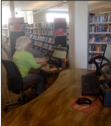
New circulation service desks provide staff greater mobility to serve customers.