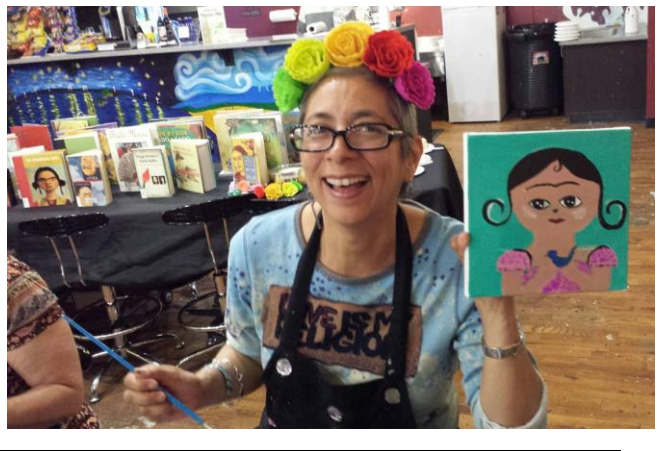
April 2016 Executive Director's Report