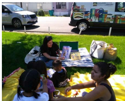
Poudre Valley Mobile Homes