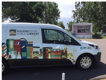
Van around the district