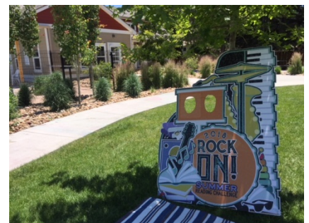
Villages on Plum