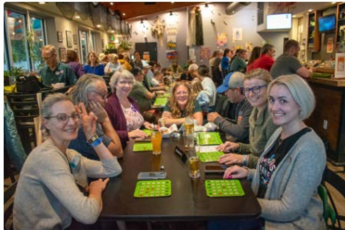
Staff at Banned Books Bingo