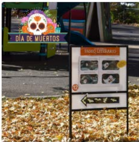
Día de Muertos Story Stroll

Hispanic & Latiné Heritage Month and Día de Muertos: Last but certainly not least is our programming around Hispanic Heritage Month and Día de Muertos. Multiple programmers across locations helped plan and facilitate these events in the libraries, in the community, and online. We highlighted the work of female Hispanic and Latina directors through a Film Series at The Lyric, talked about the history of Tres Colonias during a walking tour, made colorful calaveras at Harmony, strolled through a Día de Muertos Story Stroll in Library Park, and baked Pan de Muerto in a Zoom class. We also collaborated with various community organizations to put on a large-scale community celebration for Hispanic & Latiné Heritage Month at the Gardens on Spring Creek.